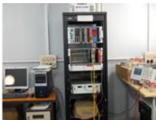
Cosmic Ray Laboratory