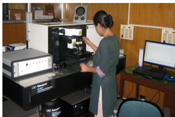
Raman Spectroscopy Laboratory