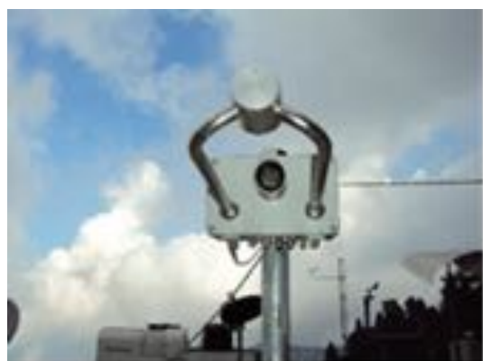
Space Science Laboratory